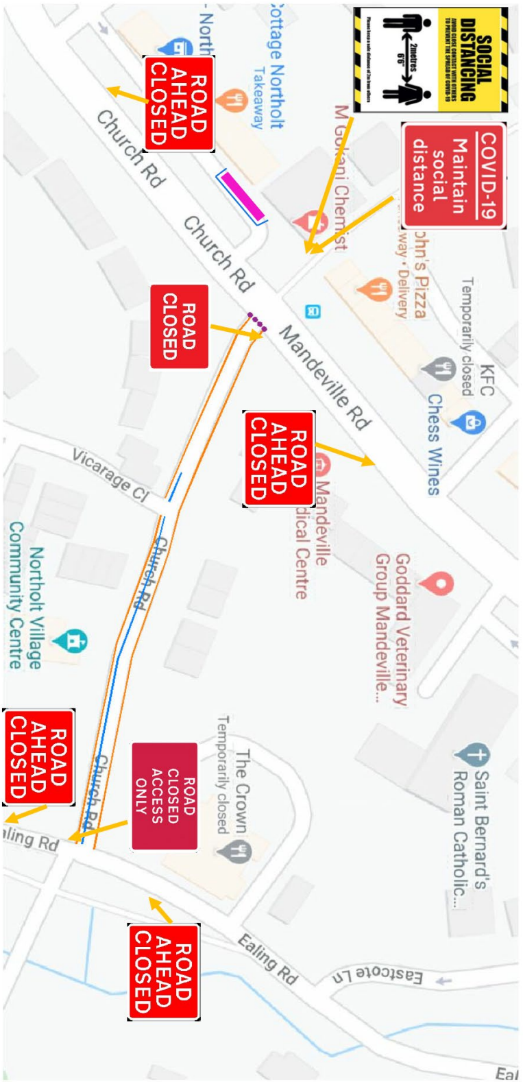
Church Road, Northolt